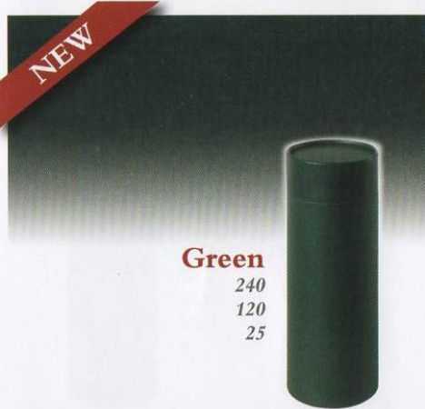
Green 240 120 25

All our Scatter Tubes are 100% biodegradable