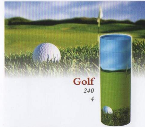
Golf 240 4