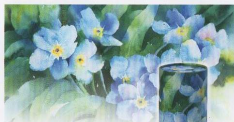
Forget Me Not