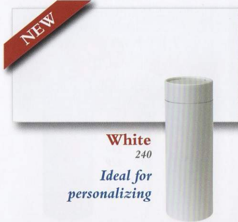
White 240 Ideal for personalizing