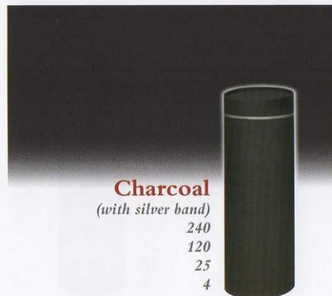
Charcoal (with silver band) 240 120 25 4