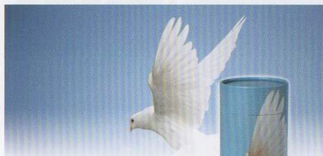
Dove in Flight